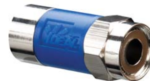
89-040 RG-6 NJX™