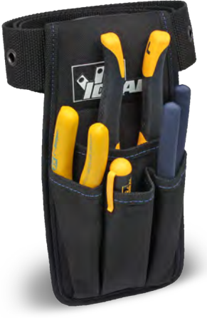
(Products not included)