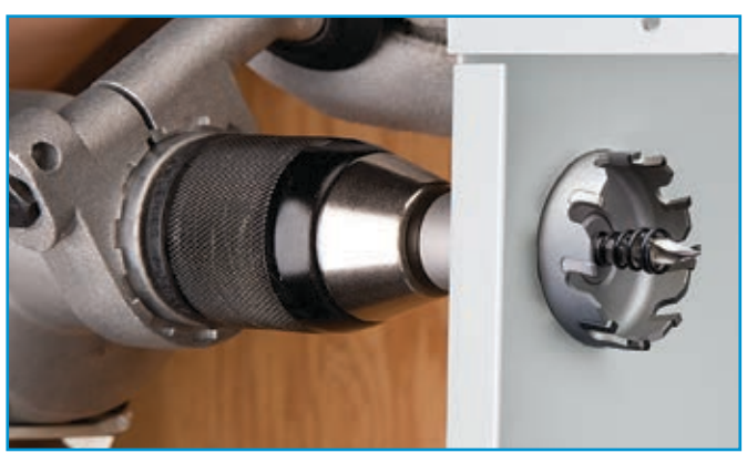
Integrated over-drill flange prevents penetration beyond the sheet metal.