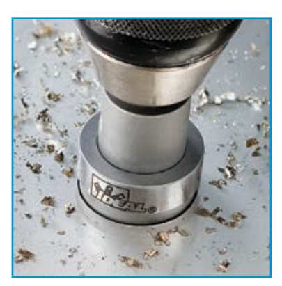
Quickly drills precise holes without penetration beyond sheet metal.

Integral arbor provides smooth accurate holes